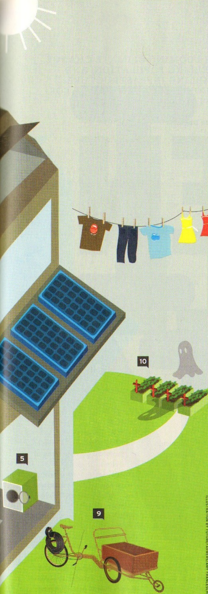
ILLUSTRATION BY FUTURE/FARMERS/AMY FRANCIS/INI