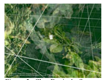
Figure 5. Char Davies's Osmose used a SCUBA diving metaphor as the interface to navigate a sublime spiritual space. (Images used with permission.)

Char Davies' Osmose [20] is a unique exploration of personal psychic and emotional space. Davies sought to shift the focus from action and agency to presence and immersion, or what she terms "immersence." "Immersents" were placed into a sublime relationship with an abstract environment that blended naturalistic forms with highly technological representation and textual poetry. There was no overt goal and using a headmounted display and sensors, players navigated in a fashion modeled after SCUBA diving, inhaling to rise, exhaling to sink and leaning from side to side to navigate. This is a radically different relationship to space than games such as Doom [36], which are focused on tactical agency and strategic exploitation of spatial constraints. Visitors to this environment described falling into a meditative state [51].