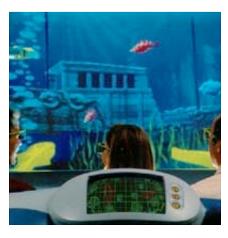
Figure 1. Virtual Adventures , designed by co-author Pearce for Iwerks Entertainment and Evans & Sutherland in 1993.

Another key example is Brenda Laurel and Rachel Strickland's PLACEHOLDER [41], which sought to use digital space as a means to inscribe landscape with a sense of spirituality and narrative. Drawing from local landscapes and native lore around the around the Banff Centre in Alberta, Canada (where the piece was developed), they placed players in the roles of animals who could explore landscapes, listen to and leave their own stories behind. A highly evocative piece focusing on embodiment and relationship to nature, PLACEHOLDER aimed to create a