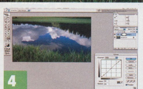
USE YOUR DOWN ARROW to darken the shadows you marked. Tap it down until you like how it looks. Choosing your own highlights and shadows is a great way to get more control over contrast.